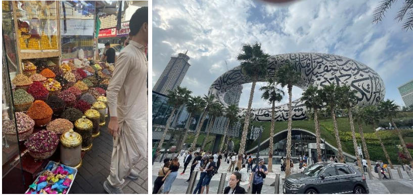
Figure 3 International Spice Market – blocks and blocks of spices from around the world.