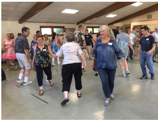
Socializing was an important aspect of dancing with the Glenview Squares before the organization had to host virtual events.

May 15 was supposed to be a big day for Glenview Squares. Members were looking forward to attending a dinner dance celebrating the square dance club's 70th anniversary.